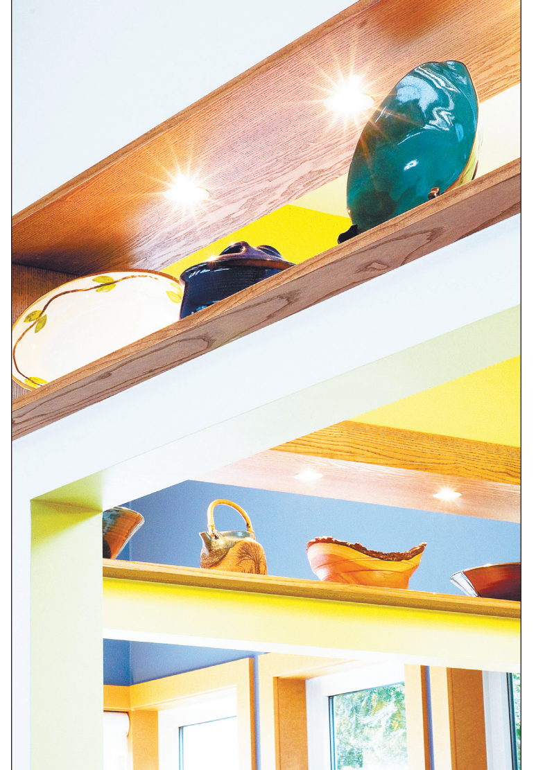
Hazy Skies by Benjamin Moore provides a neutral backdrop for the art collected locally by Kreps and Guenter.