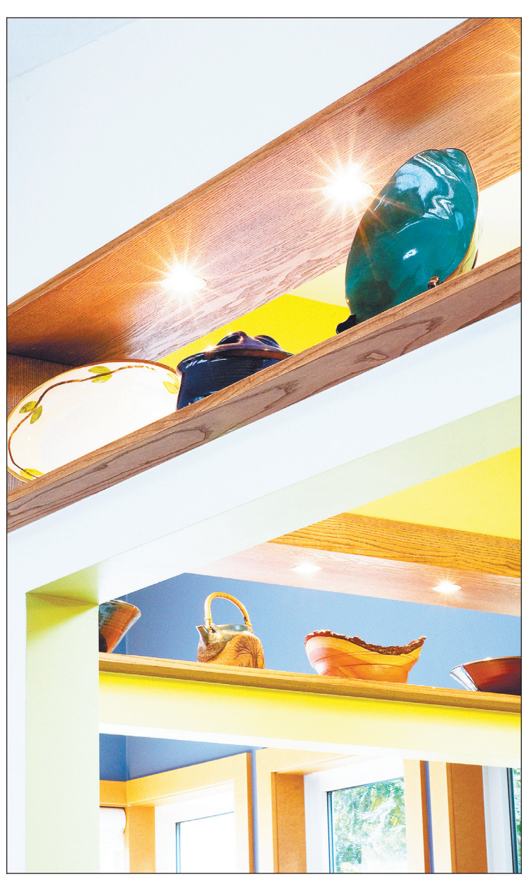
An airy feel is reinforced by open shelves to kitchen and sunroom.