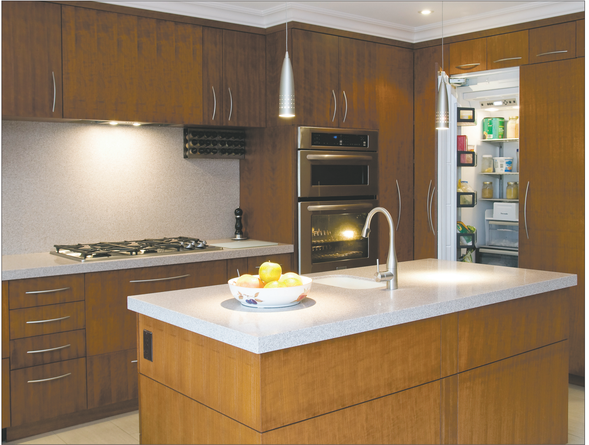
Maple cabinets conceal a drawer dishwasher, fridge, washer and dryer. The kitchen island offers additional storage as well as one of three sinks.

THE HAMILTON SPECTATOR ■ FEBRUARY 5, 2011 ■ THESPEC.COM