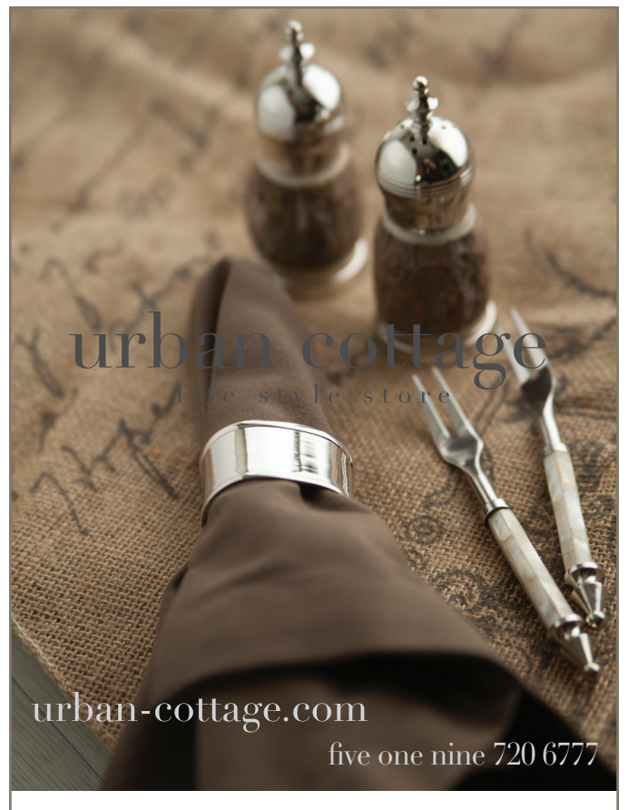
Located between Brantford & Ancaster on Hwy 2/53